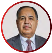
Dr. Mohamed Maait

Executive Director International Monetary Fund - IMF